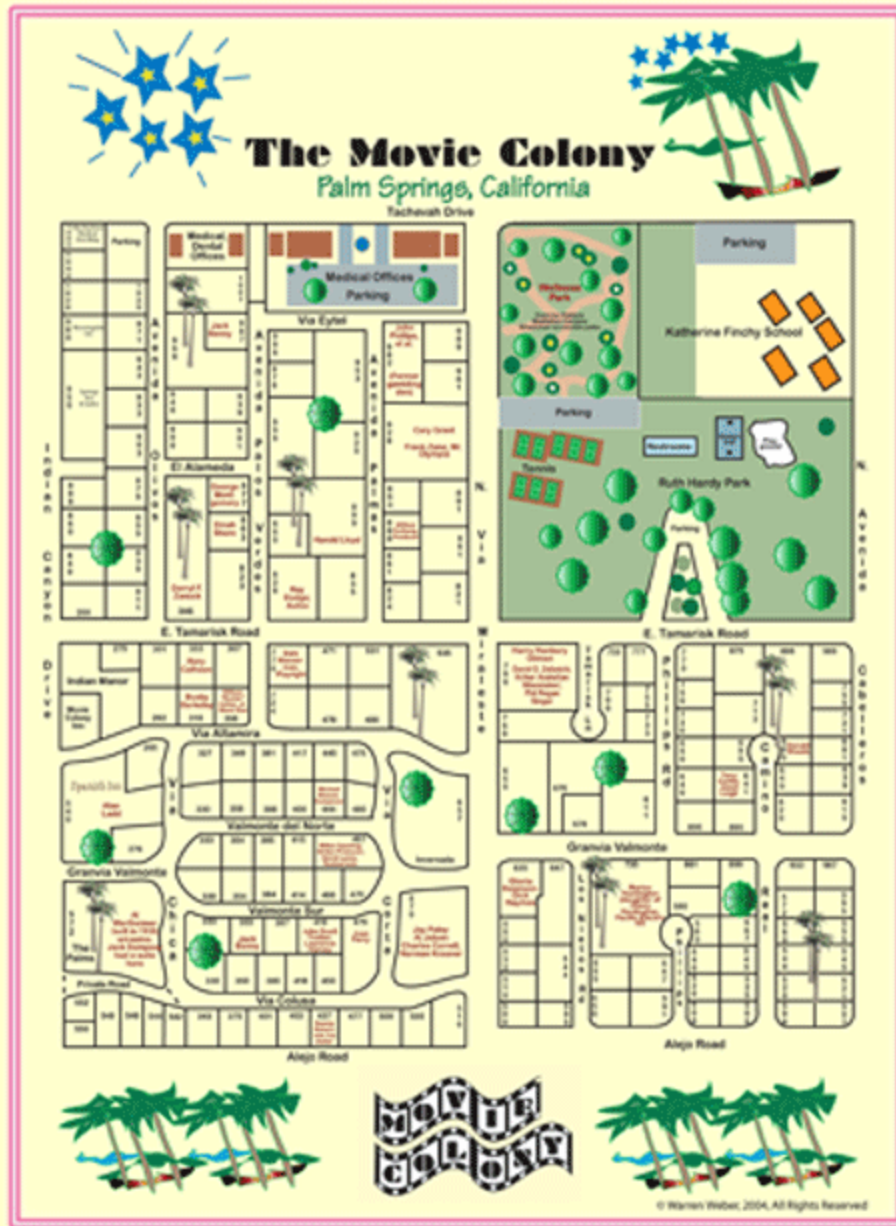
The sample map shown here isn't very readable, but gives you an idea of it. Full-color 13"x19" maps will be available for sale, and if there's interest, larger sizes may be made produced.